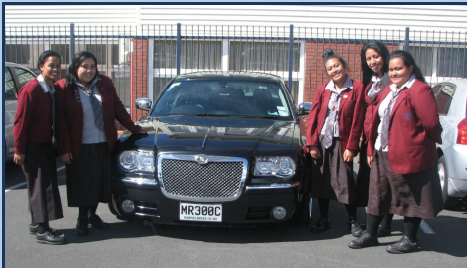
The Ball Committee on their way to the Ball Expo