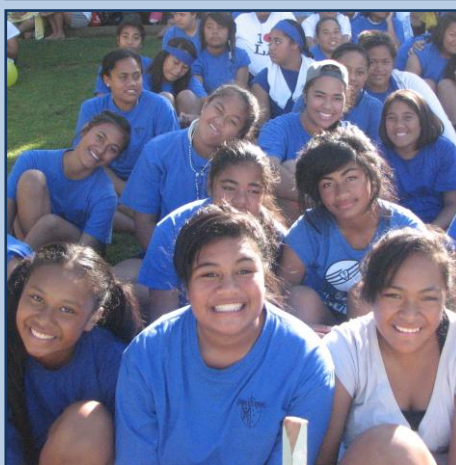
Junior Swimming Carnival House Colours